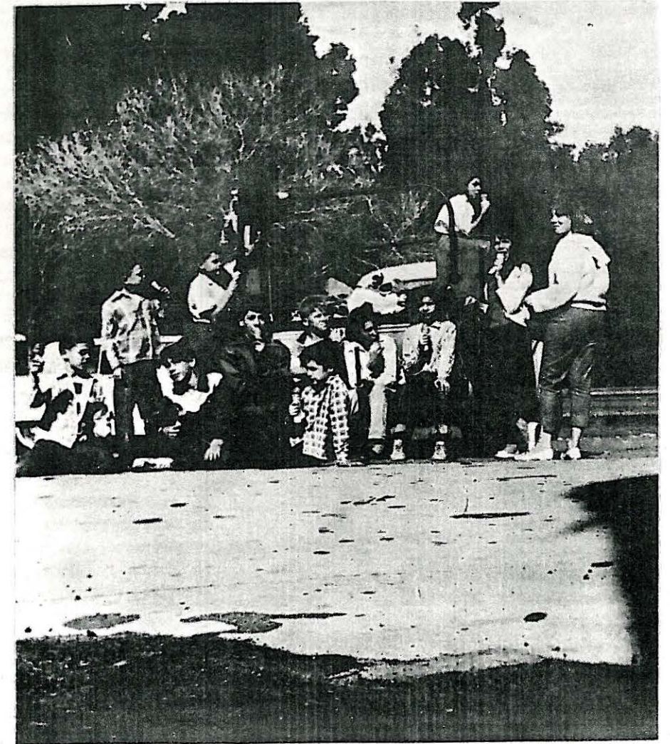
HIGHWAY CLEAN UP BY 4-H MEMBERS

PRICE FIVE CENTS VOLUME 4, NUMBER 4, Page 1